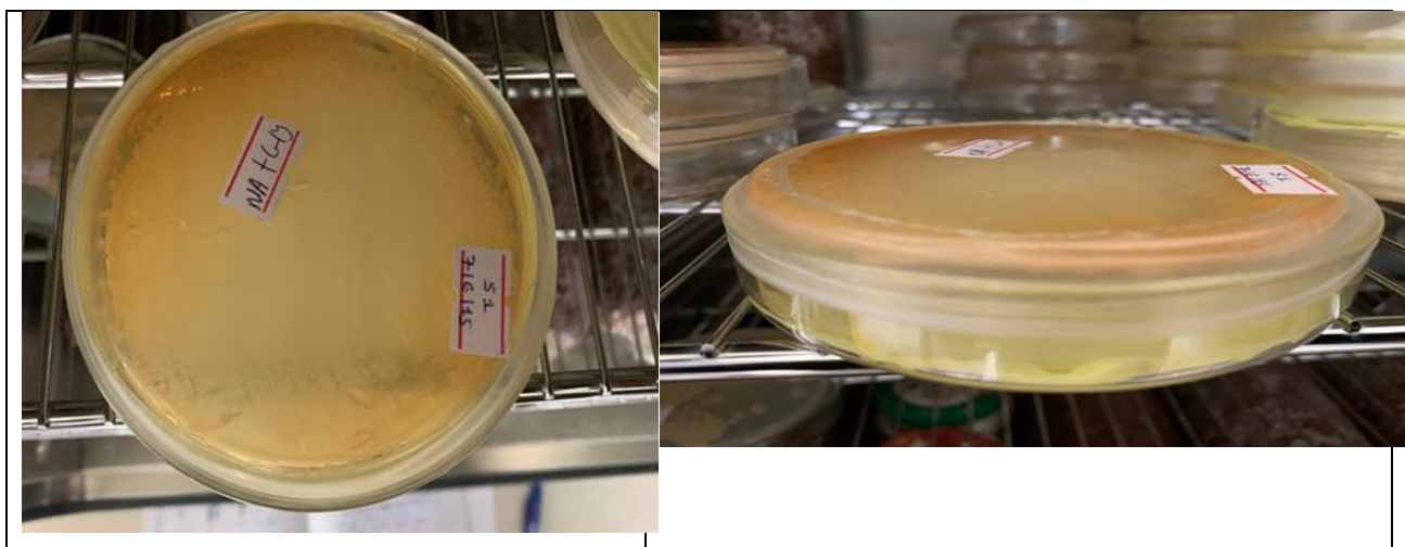
Fig 5. Plate based qualitative assays showing HCN production

HCN production is ascribed as one of the mechanisms of biocontrol activity of rhizobia, the ability of the 72 isolates to produce HCN was determined by the picric acid assay. Only two Rhizobium cultures, were produced HCN scored as moderate (++) for GNR-37 and weak for GNR-28 whereas the remaining 70 isolates not changed the yellow color of the picric acid solution treated filter paper, implying majority of the groundnut isolate were failed to produce HCN (Table 2).