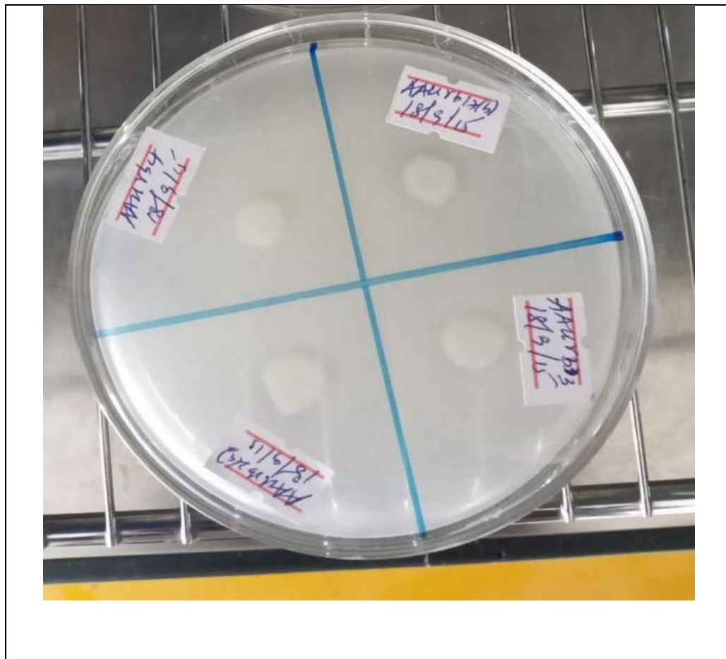
Fig.2. Clear zones of phosphate solubilization on Pikovskaya's agar plate

Phosphate-solubilizing bacteria were identified based on their ability to form a clear zone around the colonies after 48 hours of incubation on Pikovskaya's agar plates following spot inoculation. These clear zones indicated positive phosphate solubilization tests. Out of the 72-rhizobial isolates tested, seventeen isolates (23.6%) demonstrated the capability to solubilize tri-calcium phosphate. The diameter of the halo-zones surrounding each colony varied among these seventeen phosphate-solubilizing bacteria, indicating differences in their phosphate solubilization capacity (Table 2). The clear zone diameters ranged from 1 mm to 3 mm, with isolates GNR-67 and GNR-28 displaying the largest and smallest clear zones, respectively. Additionally, the phosphate solubilization indices formed by these isolates varied between 1.7 and 2.45, indicating variations in their effectiveness in solubilizing phosphate.