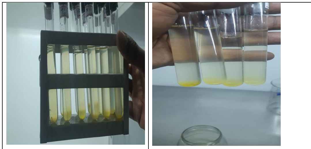
Fig 3. Test for ammonia production of rhizobial isolates

Screening of the rhizobial isolates for ammonia production were, an important trait of PGPR that indirectly influences the plant growth and performance. Of all the tested Rhizobium isolates, two isolates were (GNR-28, GNR37) exhibited as strong (+++) ammonia producer, six isolates (GNR-3, GNR-7, GNR-19, GNR-34, GNR-43 and GNR-54) were produce moderately (++) .Whereas the rest isolates were scored as weak (+) for Ammonia production.