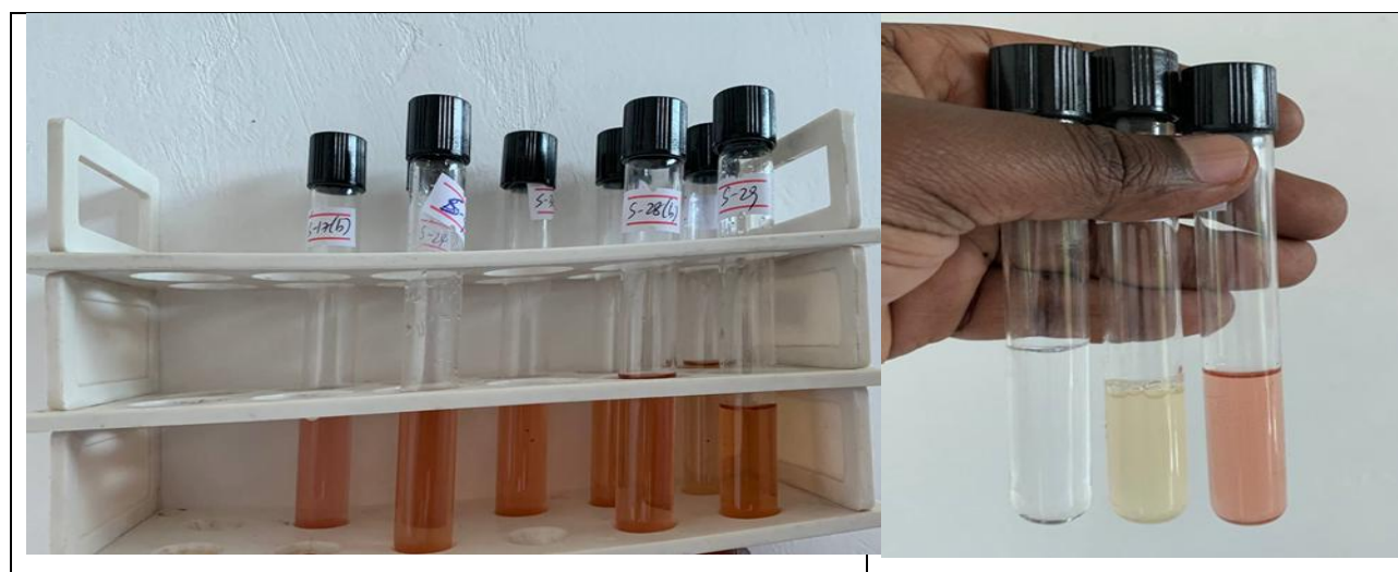
Fig.1. IAA production of tested isolates

The groundnut rhizobia isolates exhibited significant variations in their ability to produce Indole Acetic Acid (IAA) when cultured in tryptophan-supplemented YEM broth media. Out of the 72 isolates tested, 52 isolates (72%) demonstrated detectable levels of IAA production, ranging from 7.4 to 78.8 \mu\text{g}\cdot\text{ml}^{-1} . However, the remaining 20 isolates had IAA levels below the detection limit. Notably, isolate GNR-43 displayed the highest IAA production at 78.8 \mu\text{g}\cdot\text{ml}^{-1} , followed by isolates GNR-37 (77.2 \mu\text{g}\cdot\text{ml}^{-1} ), GNR-28 (67.8 \mu\text{g}\cdot\text{ml}^{-1} ), GNR-34 (66.8 \mu\text{g}\cdot\text{ml}^{-1} ), GNR-03 (65.8 \mu\text{g}\cdot\text{ml}^{-1} ), GNR-07 (58.8 \mu\text{g}\cdot\text{ml}^{-1} ), and GNR-54 (56.8 \mu\text{g}\cdot\text{ml}^{-1} ) (Table 1). These findings highlight the considerable variability in IAA production among the groundnut rhizobia isolates.