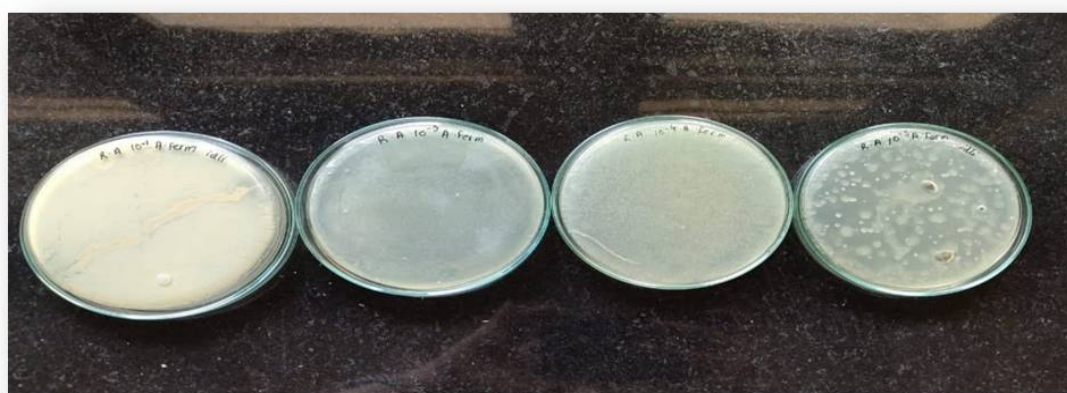
Figure 3. Spread plate of dilutions on Rogosa agar plate

A lot of further studies can be done for identification of the various organisms isolated from the batter. Identification of isolated organism from idli batter can be done up to species level. Study of succession of microorganisms as fermentation proceeds can be undertaken. Study of change in pH at different time intervals and the growth of microorganisms at different pH during fermentation process can be studied. The nutritional profile, microbiological profile, carbohydrate factor, presence of vitamins, amino acid and proteins before and after fermentation process of idli batter can also be analyzed.