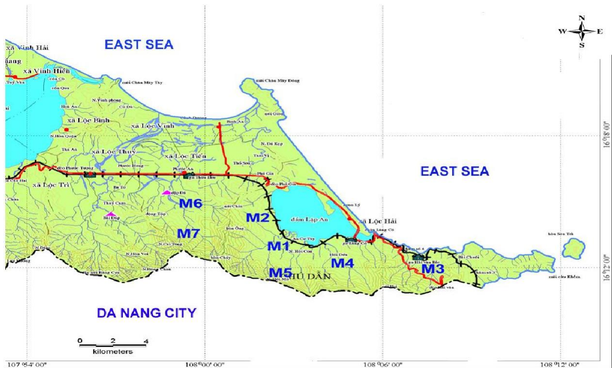
Figure 1. Aquatic insect sampling points in the Hai Van area, Thua Thien Hue province