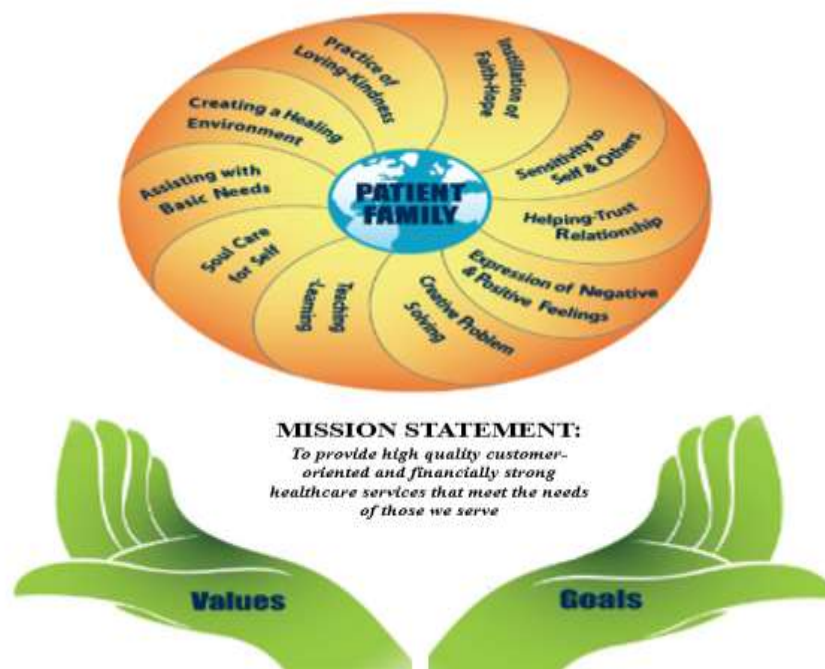
Figure 3. The theory of human caring.

Nurse-related barriers. Because nurses don't know the proper dosage for opioids or know how to deliver them, patients' pain is still not adequately addressed in hospitals. The most significant obstacles to nurses implementing pain treatment, according to a number of studies [6], include knowledge gaps, insufficient pain assessment, and unwillingness to administer opiates. The staff nurses noted a number of challenges, such as prescriber attitudes and beliefs, dosage selection, errors in prescribing, and limited knowledge of opioid preparation. In order to effectively advocate for their patients' needs in pain management, nurses are in a unique position. Unfortunately, due to time constraints, a lack of education and experience, and challenges with pain assessment, nurses might not be equipped to speak out for patients.